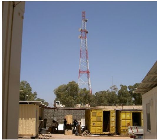
My Daily Office View