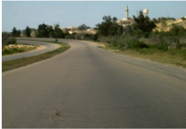
The long Winding Road Home