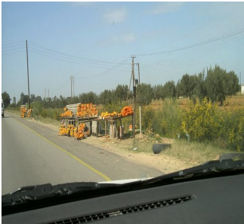
A Roadside refreshment Stop