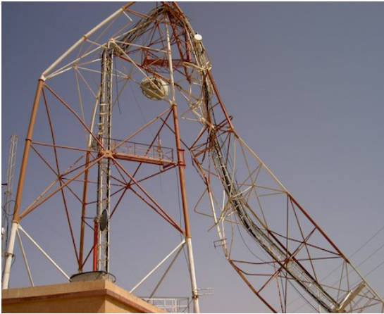
The Giants Playtoy