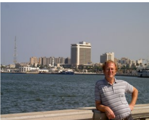
Just another day at work