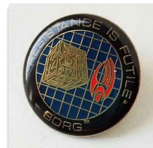
Here is the Borg pin in more detail

My intention is to put all of these on a velvet backing and to display them in a small Perspex box so they do not collect dust and deteriorate. I started collecting things like this a number of years ago and have added to them over the years, with help from my family by way of a number of gifts. I originally found a lot of these items in Holland, when I was working there, as I was making my way around the exhibitions with a friend.